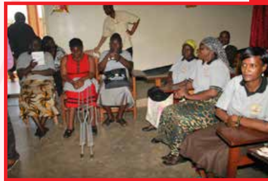
The Newly Elected B.O.D Members