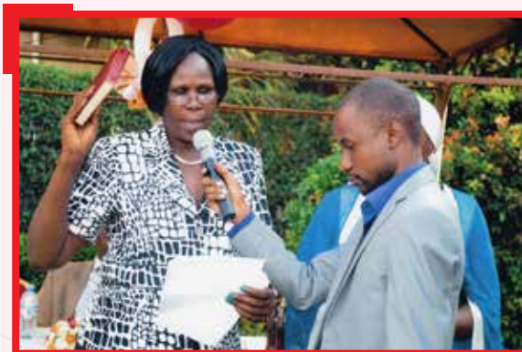
Madam Achayo swearing in for new mandate of office