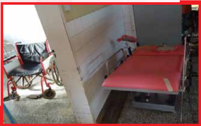
An adjustable bed in Nebbi Regional Hospital, Nebbi District.

Through NUWODU's effort to advocate for the provision of disability friendly beds in health centers with Ministry of Health, an adjustable bed was procured for the Maternal ward in Nebbi Hospital to ensure access to maternal Health care to pregnant Women with disabilities.