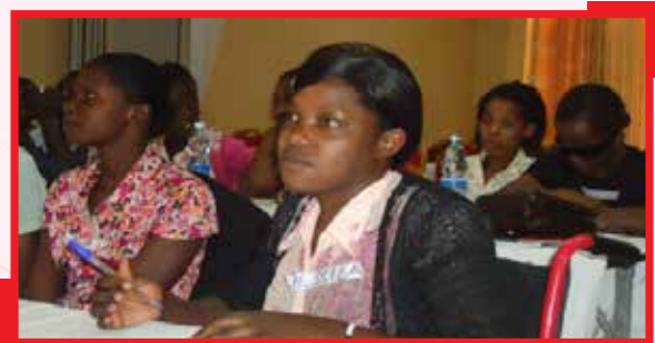
Girls with disabilities from universities of Uganda during a mentorship workshop on knowing self.

In this year ( 2015), NUWODU has taken on three Girls with Disabilities from Makerere University and they are engaged on job training .