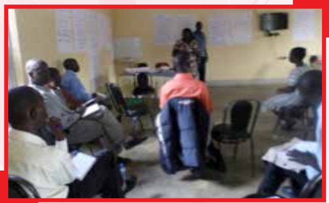
Teachers being sensitised on the need for sex Education among Girls with disabilities