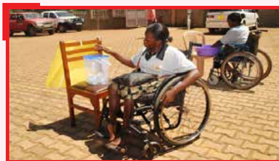
Delegates casting their votes during the 4th General assembly

In December 2014, NUWODU saw an era of new leaders after its membership had exercised their political freedom and right to elect new Board members who would take forward the vision of the Organisation. The reports for progress of work for the last five years ( 2009-2014) and the constitution were reviewed and amendments made.