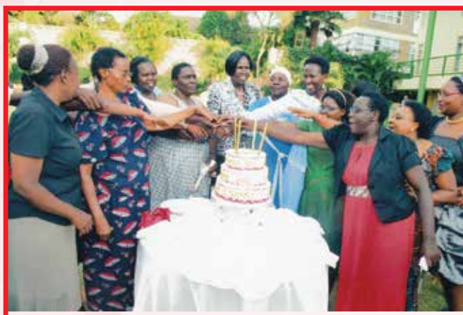
The Outgoing B.O.D cutting a cake with the New B.O.D.