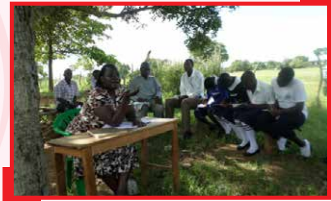
Girls with disabilities listening attentively to the Facilitator from Straight Talk Foundation in Mamba Secondary School.

Sex Education prepares girls to choose safer sex choices as they grow up.