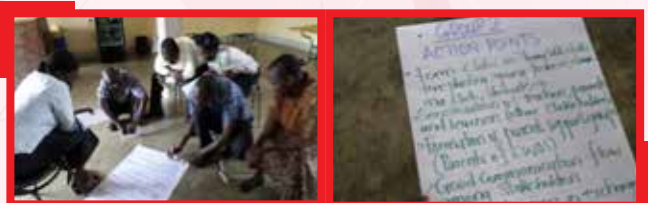
Action points drawn on paper to support intergration of Girls with disabilities in Sexual Health talks

Teachers are mainstreaming disability into sex education and Girls with Disabilities are able to choose safer sex choices because of the information given.