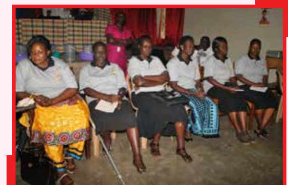
The newly elected Board of Directors